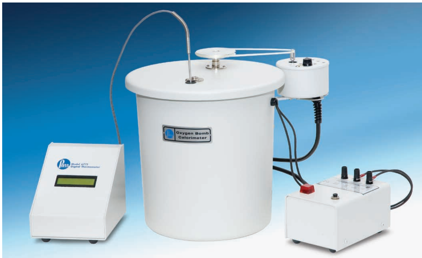
1341 Calorimeter with 6775 Digital Thermometer & 2901 Ignition Unit